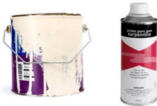
Paint & Turpentine