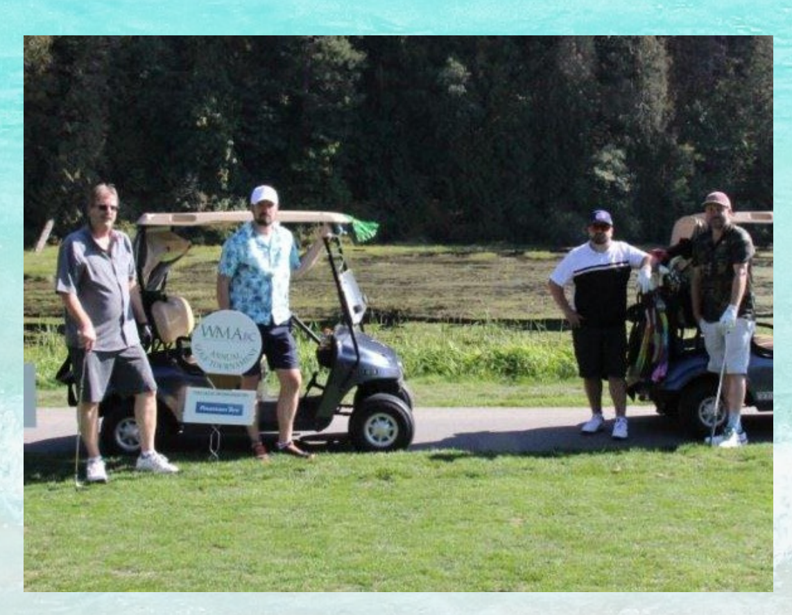
TEAM 11A MAPLE LEAF DISPOSAL / DAVIS T&S METAL RECYCLING