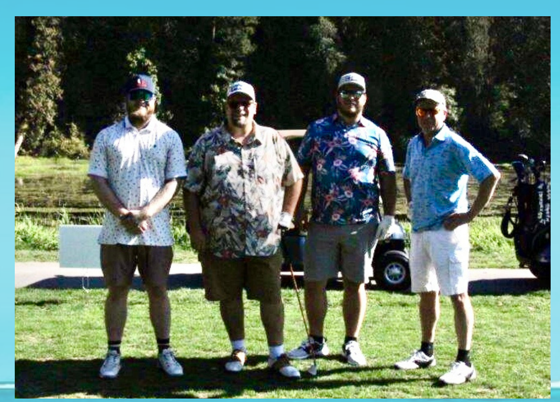
TEAM 10A EMTERRA