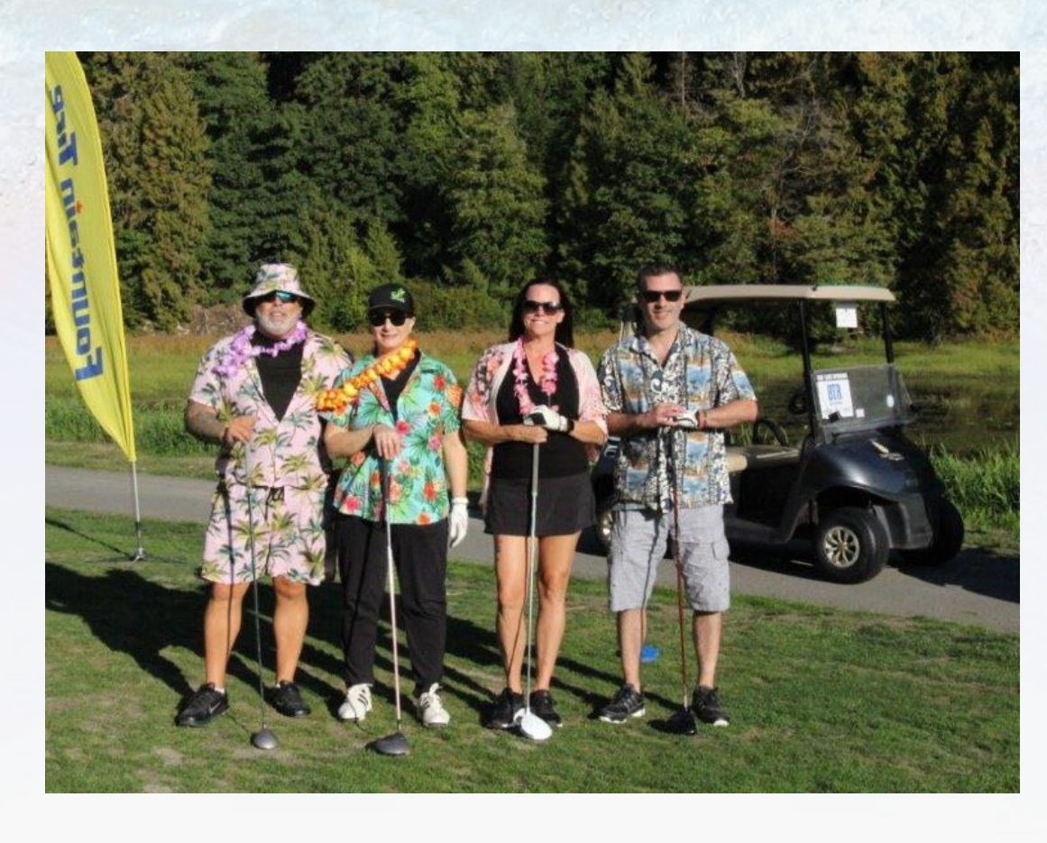
TEAM 3A 9FL - COQVITLAM