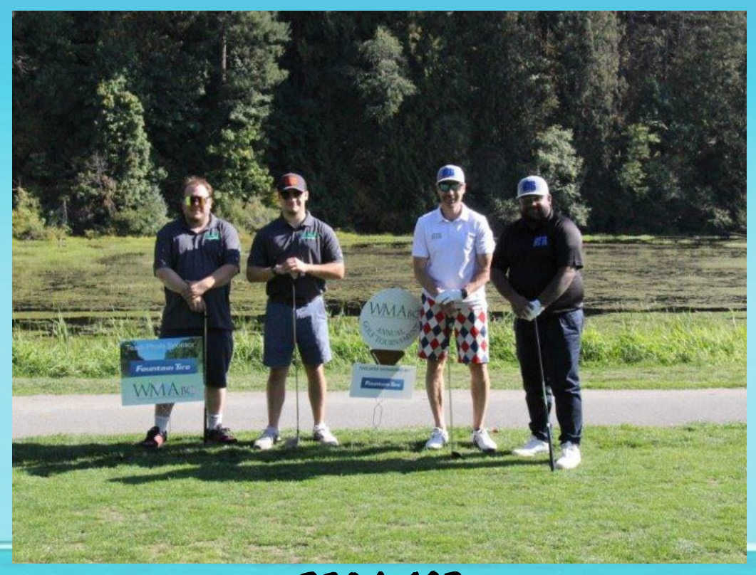
TEAM 10B BIG TRUCK RENTAL / Z-ROW RECYCLING SYSTEMS