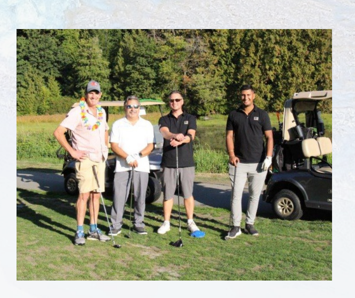
TEAM 3B ABC RECYCLING