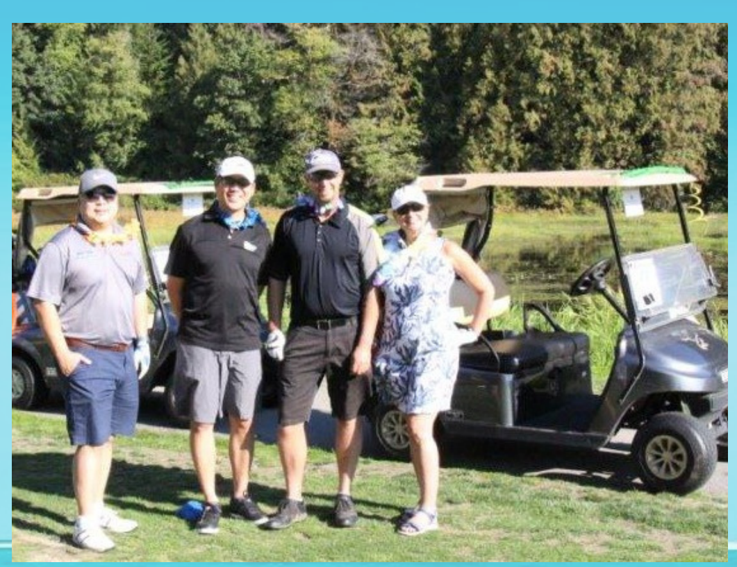
TEAM 7B k2 SERVICES/SAFETY ORIVEN/ECOSAFE