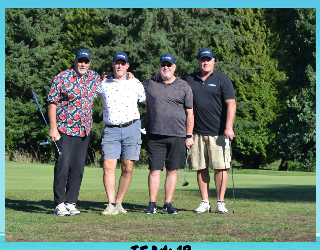
TEAM 1B EMPOWER ENVIRONMENTAL