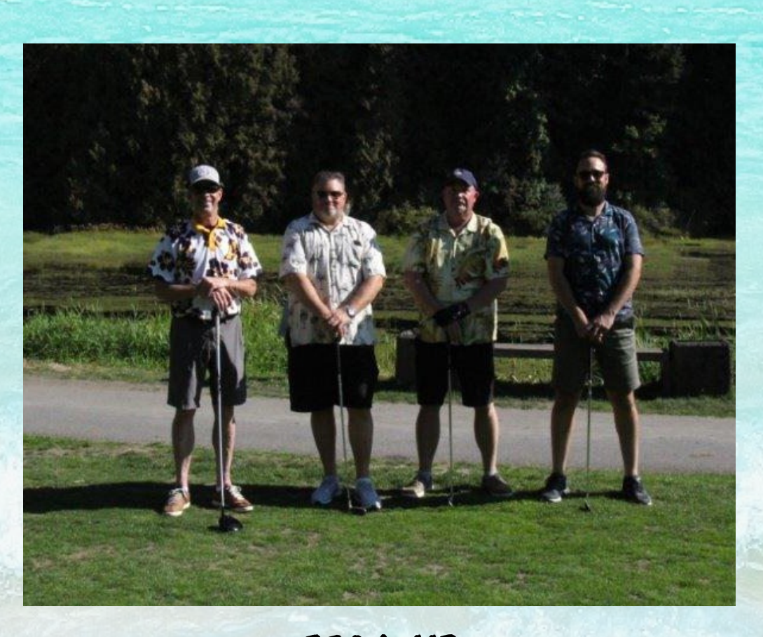
TEAM 11B MINI BINS / VIMAR EQUIPMENT