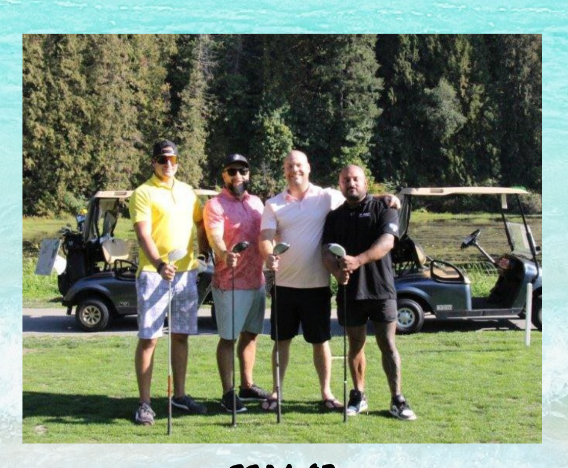
TEAM 8B FIRST TRUCK CENTRE / FALCON EQUIPMENT