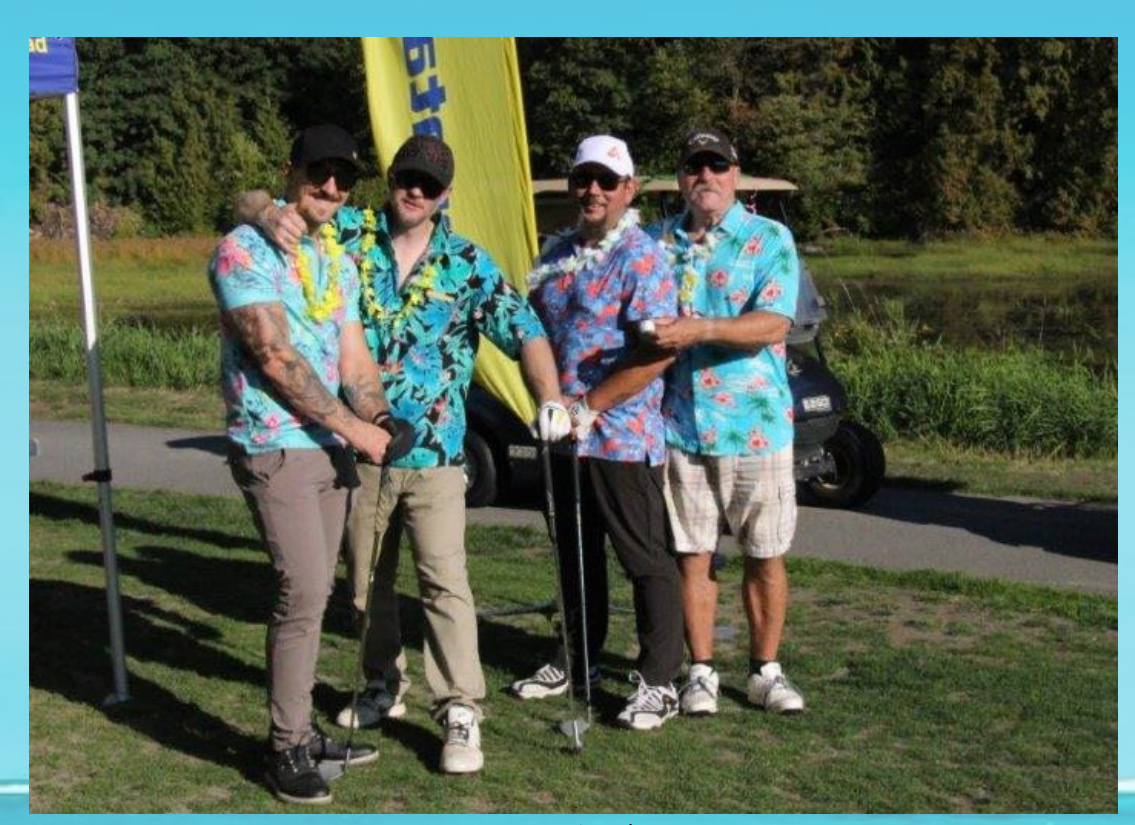
TEAM 4A METRO COMPACTORS