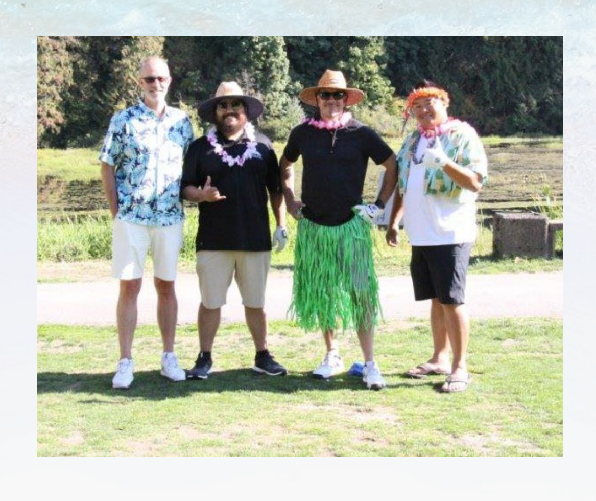
TEAM 9A HEADLANDS ENVIRONMENTAL