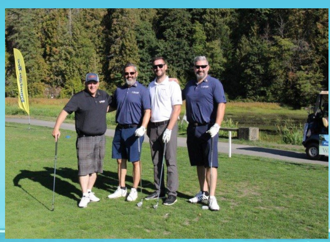
TEAM 7A INLAND KENWORTH