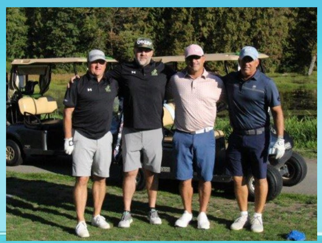
TEAM 4B 9FL - COQUITLAM