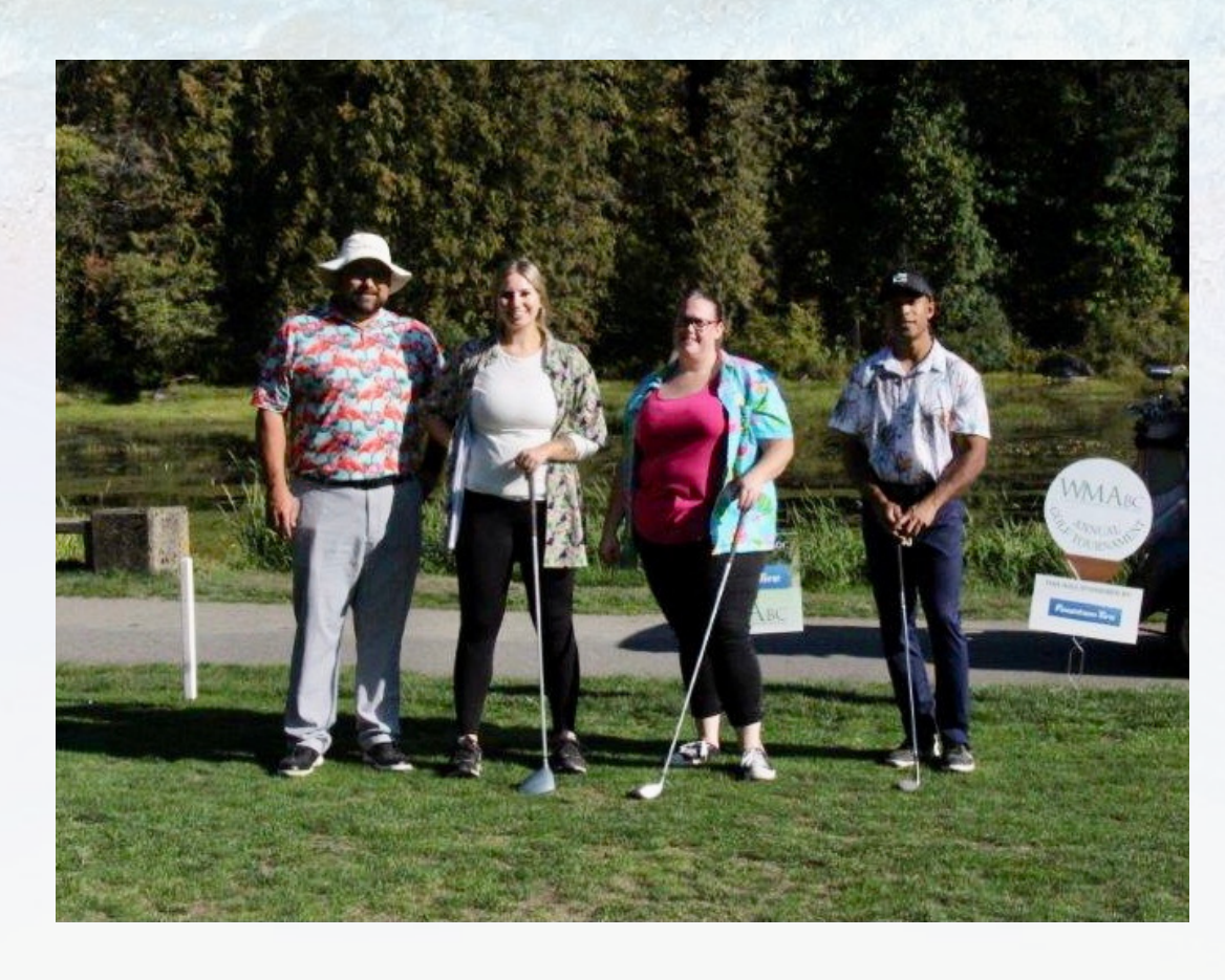
TEAM 6A VALLEY WASTE & RECYCLING