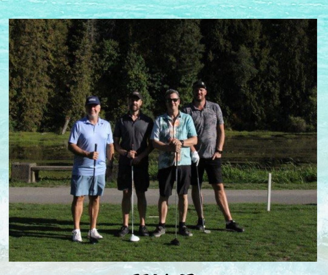
TEAM 5B ROLLINS MCHINERY/ANACONDA SYSTEMS