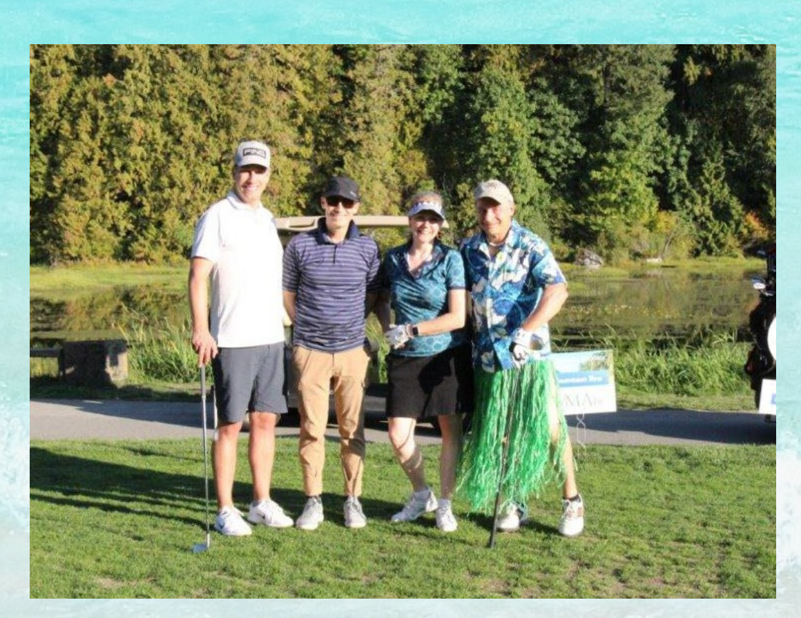
TEAM 2A WASTE CONTROL SERVICES