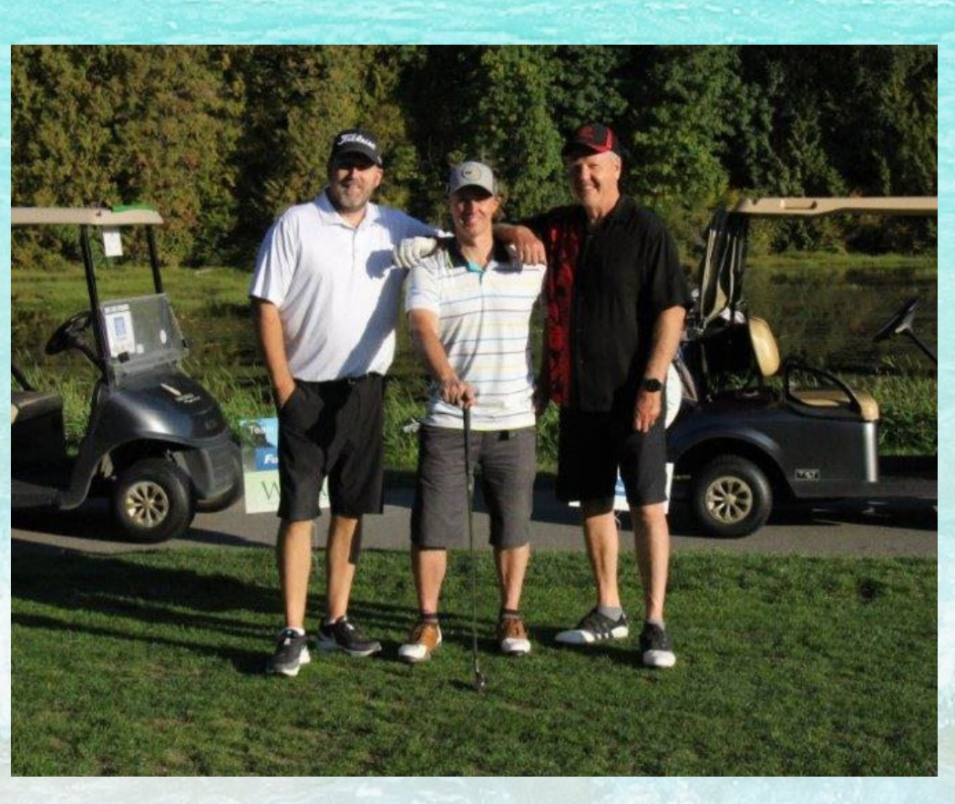
TEAM 2B WASTE MANAGEMENT