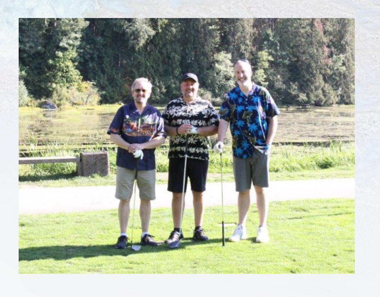
TEAM 9B TARGET ZERO WASTE/ATSOURCE RECYCLING AJM DISPOSAL