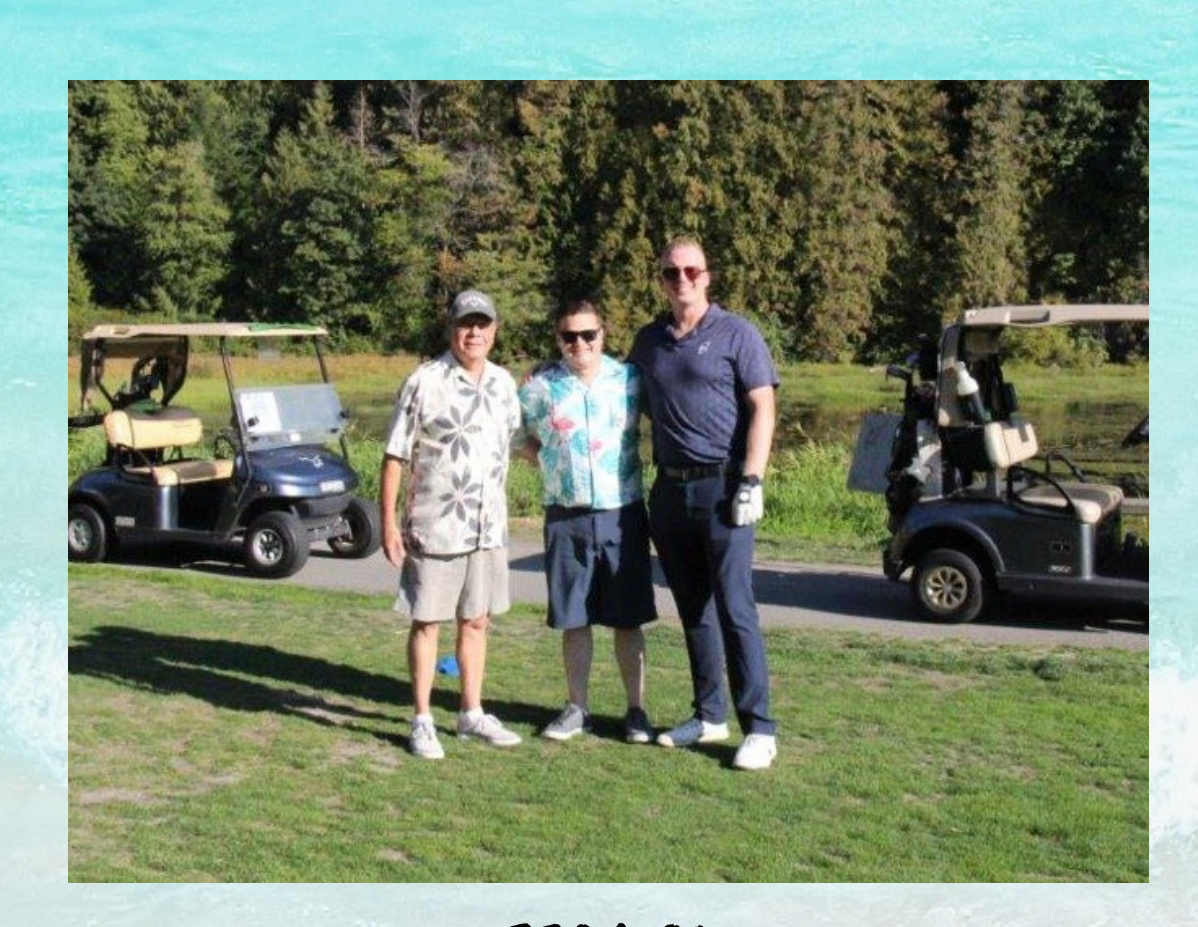
TEAM 5A WESCAN DISPOSAL