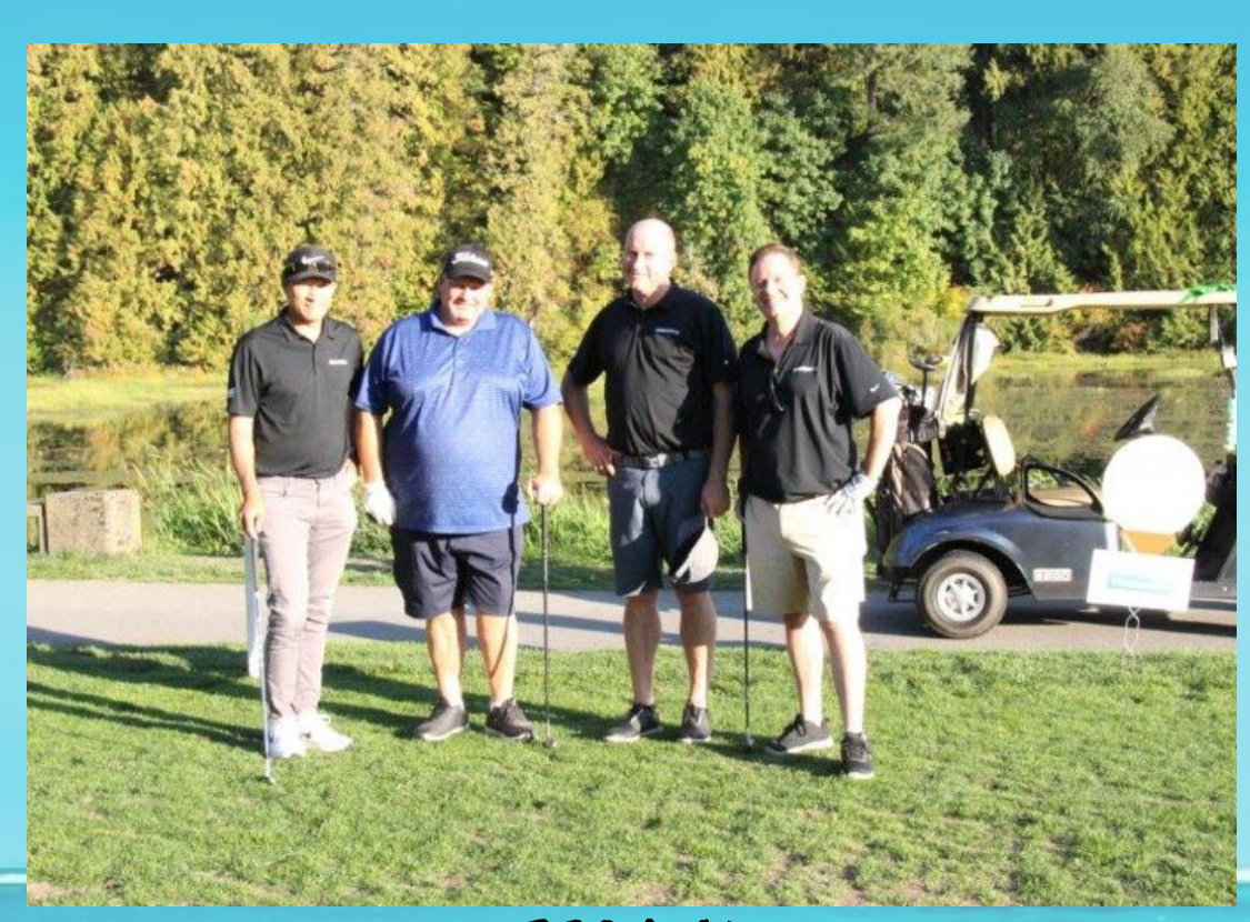
TEAM 1A ECOWASTE INDUSTRIES