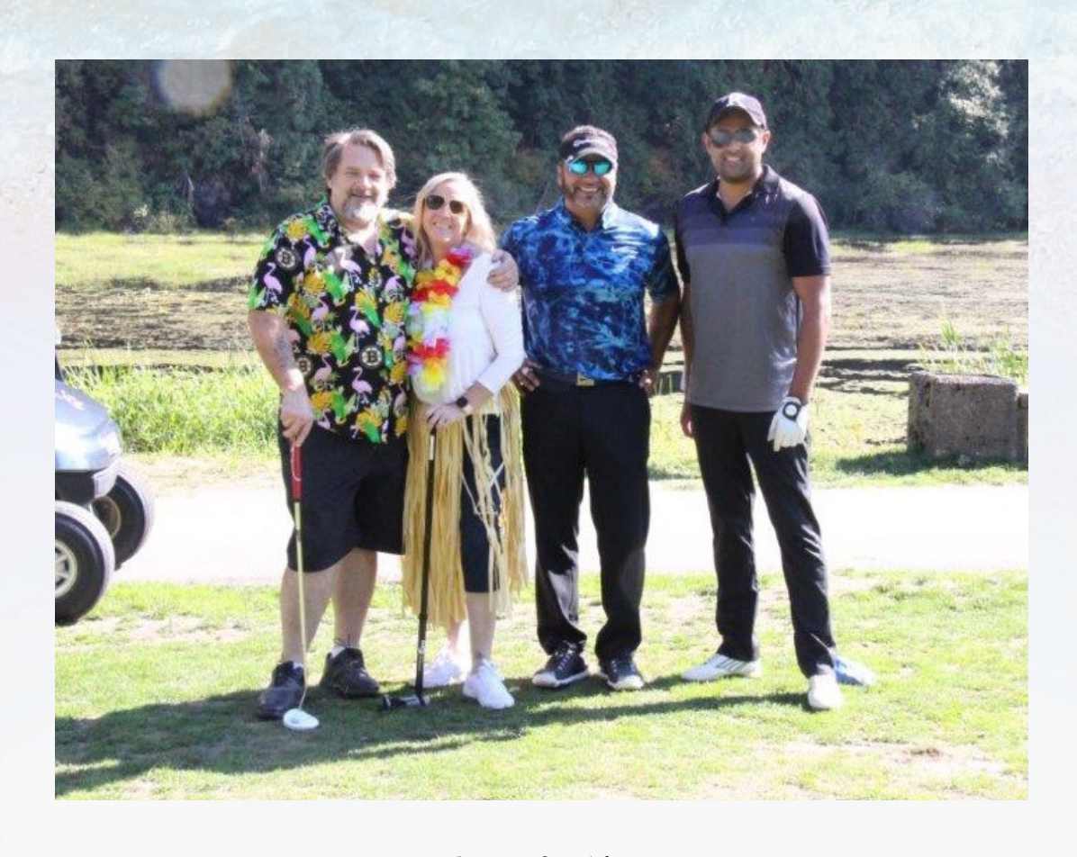
TEAM 12A MAPLE LEAF DISPOSAL / SMALLWOOD BIO FVEL