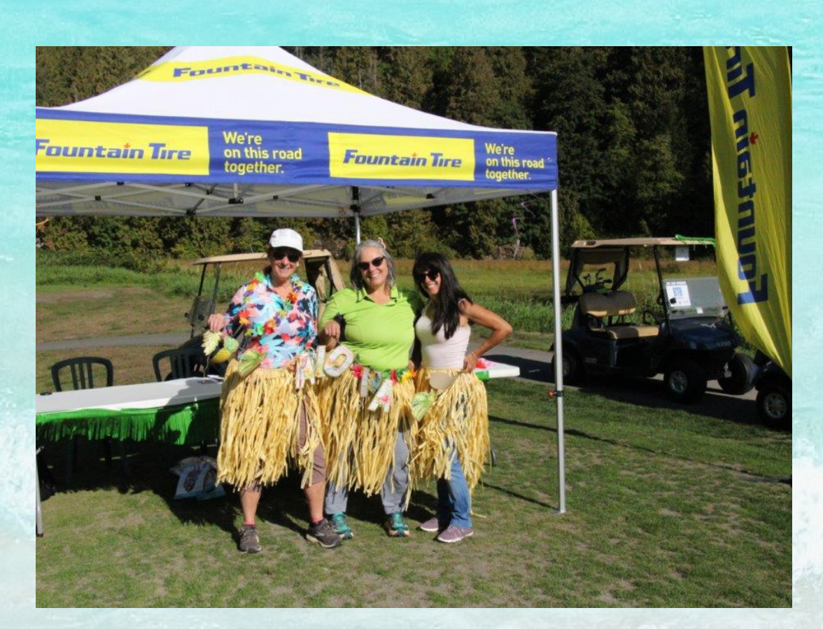
TEAM 8A 9FL - SQUAMISH